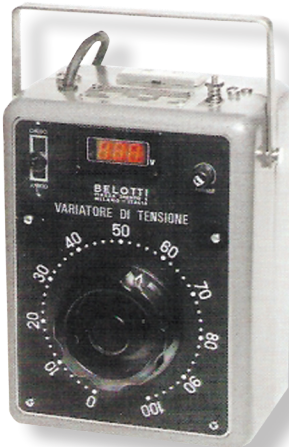
Unit with Digital Volt-Meter