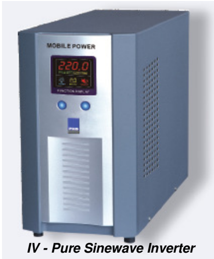
IV - Pure Sinewave Inverter